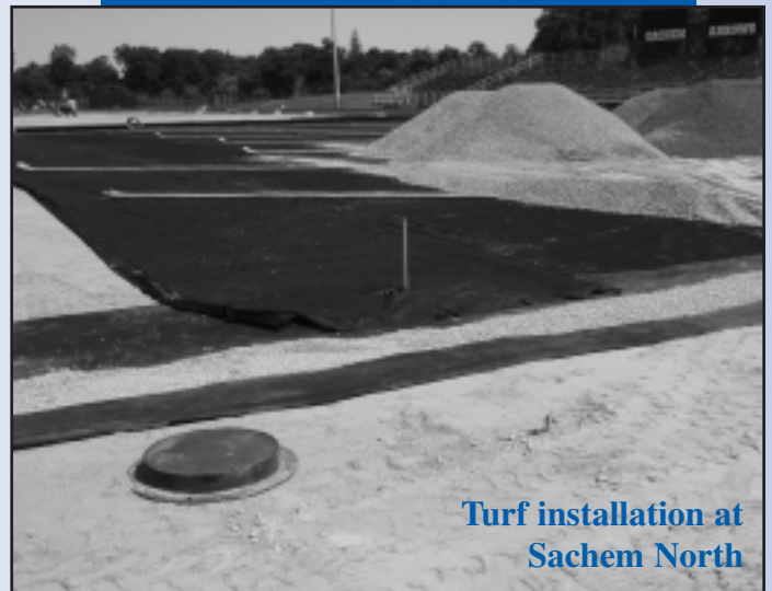
Turf installation at Sachem North

Turf field installations at Sachem High School East (above) and Sachem High School North (below) provide safer, all-weather playing surfaces that will also save future costs on maintenance and irrigation.