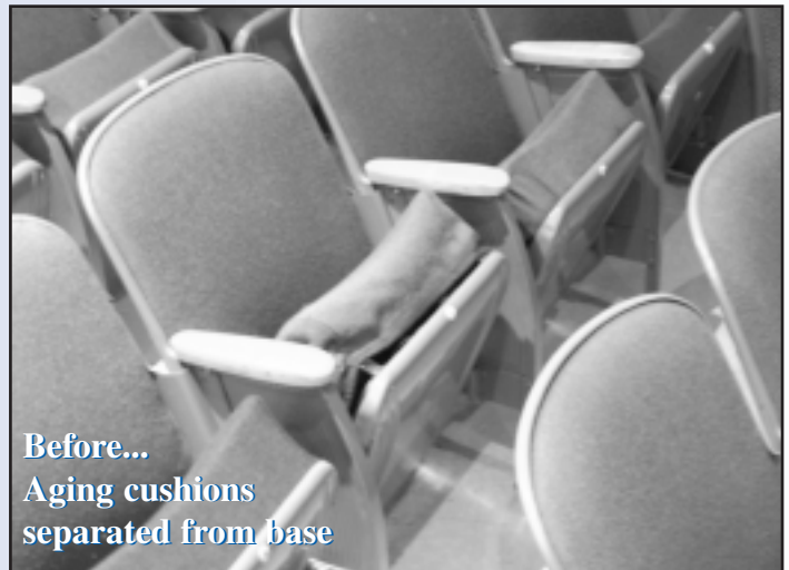
Before... Aging cushions separated from base

Auditorium seats with broken arms and missing cushions at Sachem High School North and Samoset Middle School have been replaced with completely new seating.