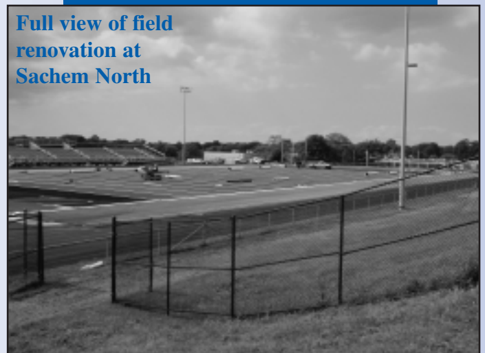
Full view of field renovation at Sachem North

Press box is scheduled to be delivered in November