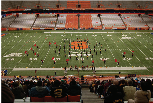
The Sachem Arrows Marching Band performing at the State Championships